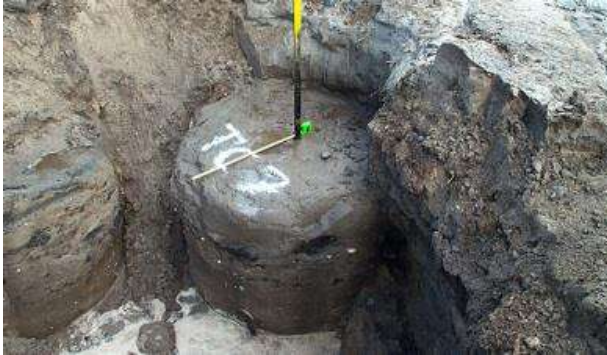
Fig. 1. Ground-cement piles.

devices are used. The installation of soil-concrete piles according to the Soilmix method is as follows : a special device with a drilling tip, equipped with cutting blades, is immersed in the soil (Fig. 1). While the blades cut the soil layer and mix it, a liquid cement slurry is fed through the holes in the tip under high pressure.