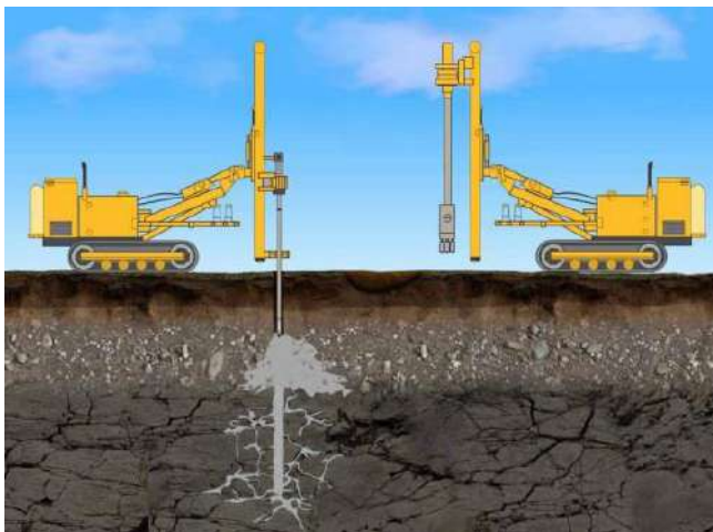
Fig. 3. High-pressure soil injection.

This method is effective and efficient in strengthening silty, silted, peaty soils. The device of these piles does not create additional dynamic loads, therefore they are actively used in the construction of new buildings, as well as for straightening inclined ones in the conditions of cramped urban development.