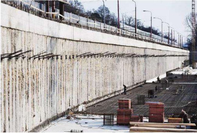
Fig. 1. Reinforcement of the pit walls with sheet piles with anchors.