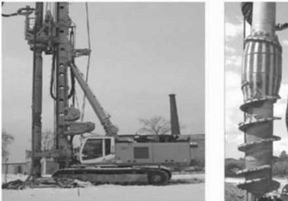
Fig. 4. Baue drilling rig for pile compaction and its working body.

The principle of compaction rammed piles (DDS) is to compact the soil with the rollers, which roll the soil to compact it (Fig. 4). Thus, compacted walls are formed due to soil compaction. The advantage of this method lies in the possibility of building in cramped conditions, approaching as close as possible to the existing building; when installing piles with this method, the soil is compacted, thereby improving the properties of the soil.