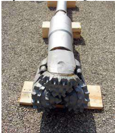
Fig. 1. Hollow drill rod for delivering mud to the well.

Bored and rammed piles of different diameters can transmit heavy loads (4000 – 25000 kN). Such piles are widely used in construction in dense urban areas, since their manufacturing technology excludes vibration and dynamic effects on nearby buildings. In construction practice, there are examples of piling in areas with weak soils, when the length of the piles reached 75m. Rotary drilling machines are used for the installation of bored piles under the protection of mud (Fig. 1).