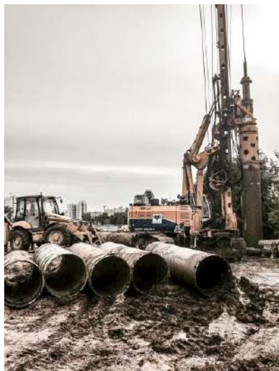
Fig. 7. Drilling wells under the protection of inventory pipes.

Conclusions. Considering the above, bored piles are promising and indispensable for the construction of buildings and structures in the cramped conditions of dense urban development.