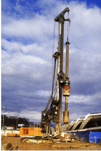
Fig. 5. Drilling rig JUNTAN PM-25.

When setting up a borehole, the tip remains in the base and cannot be removed. This technology allows the concrete mix to be immersed in a drywall. The sequence of production of Atlas piles is as follows: a pipe with a screw tip is screwed in, which cuts the soil when immersed, a metal frame is installed, a concrete mixture is injected with simultaneous extraction of the pipe.