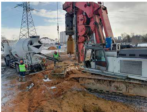
Fig. 6. Installation of bored piles using Double Rotary technology.

with a thickness of 400 mm, which are rigidly connected to each other. The advantages of this technology are: the absence of dynamic and vibration effects on the soil, which makes it possible to install piles near existing buildings and structures; the possibility of piling in difficult engineering and geological conditions.