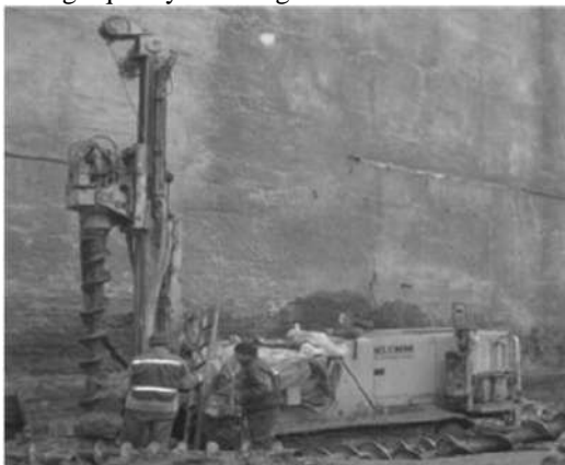
Fig. 2. Installation Klemm KR-70 for piling with short augers.

During the installation of piles with a continuous auger , the formation of the pile occurs without additional fixing of the borehole walls (Fig. 3). The technology is irreplaceable for soils with layers that differ significantly in strength. Concrete is supplied under pressure. This technology is especially effective when driving a large thickness of sands, semi-hard and refractory loams, when the manufacture of compaction piles is impossible. The advantage of piling using this technology is high productivity and high quality of filling the well with concrete.