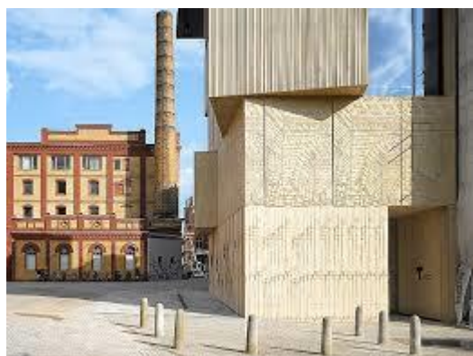
Fig. 7. The Museum of Architectural Drawing in Berlin. General appearance