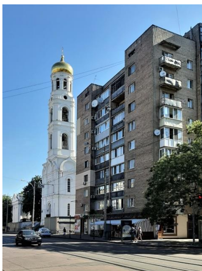
Fig. 1. The residential building on Bazarna Street in Odessa built in the 70s has influenced the perception of the entire historical quarter

One of the outstanding international documents that offers a new qualitative approach to the architectural heritage of historical cities at the beginning of the XXI century is the Vienna Memorandum [8]. The capital of Austria has several historical and architectural layers that reflect different historical eras and at the same time is a dynamically developing urbanized space. Vienna is an example of a systematic approach to the problem of the development of a historical centre, the search of a balance in the issues of preserving the architectural heritage and modern urban design (Fig. 3). The Vienna Memorandum is the result of work of the International Conference on the Preservation of the World Heritage and the Management of Modern Architecture, which took place from 12 to 14 May 2005 in Vienna (Austria) under the patronage of the UNESCO.