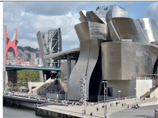
Fig. 4. The Guggenheim Museum in Bilbao by architect Frank Gehry

The essential aspects of the Vienna Memorandum are: