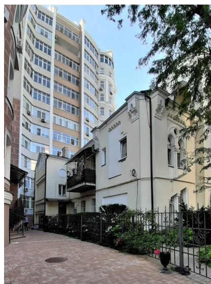
Fig. 2. The residential building on Frantsuzkyi Boulevard in Odessa was built in 2010s in close proximity to the architectural monument – the XIX century mansion, 37 Frantsuzkyi Boulevard