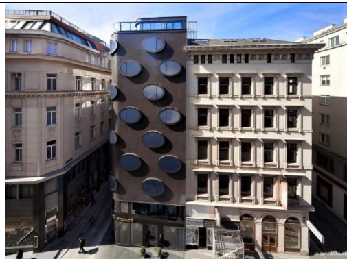
Fig. 3. A new building of the Topaz Hotel in the historical center of Vienna, 2010-2012