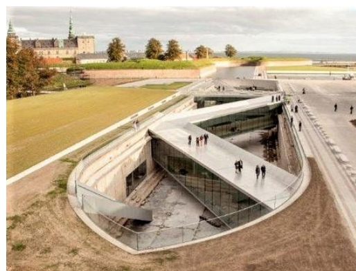
Fig. 6. The project of the National Museum of Denmark in Helsingør by the architectural bureau BIG