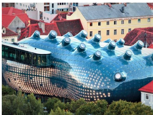
Fig. 5. The House of Arts in Graz, Austria, by architect Peter Cook

Several examples can be provided as a private view of the solution to the problem of “new” and “old” in the architecture of the historical environment. The English critic, Arthur Edwards, defines the quality of the issue solution as a “rude” and “polite” attitude. He considers such facilities as the building of the Guggenheim Museum in Bilbao by the architect Frank Gehry (Fig. 4) and the house of arts in the city of Graz in Austria by the architect Peter Cook (Fig. 5) to be a “rude” attitude to the historical context.