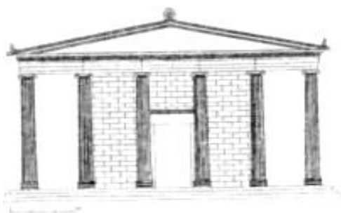
Fig. 2. The Temple of Apollo in Panticapaeum (scheme by I. P. Pichikyan)

In the construction of public and residential buildings, wall or post-beam systems were used. For the construction of buildings, immigrants used local building material: clay, raw brick and stone - shell rock. Burnt brick was used mainly for decorating the building. For the construction of galleries and porticoes, wooden structures were widely used.