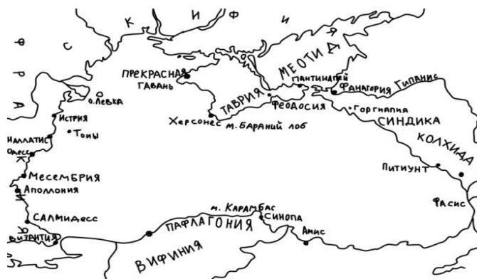
Fig. 1. Pontus Euxinus

To select the area for founding the city, following necessary factors were taken into account: a bay convenient for the port; trade routes and deep fairways; fertile land and the availability of sources of drinking water; elevated place, taking into account defensive capabilities; the availability of building material; natural resources.