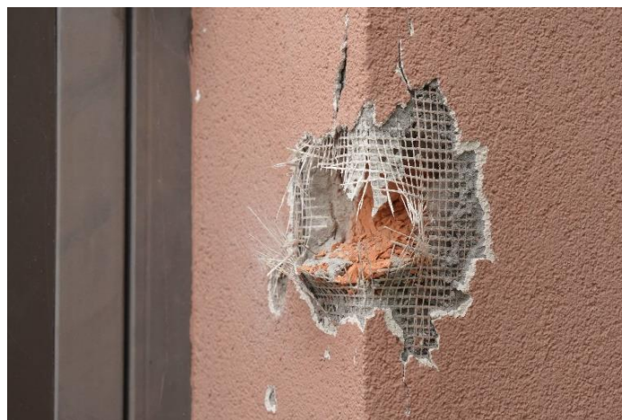
Fig. 3. Damage to the façade from debris and shrapnel

To prevent and solve these problems, it is important to carry out regular technical inspection of the façade, take maintenance and repair measures, as well as choose high-quality materials for construction and cladding. Regular examinations allow you to identify problems in the early stages and avoid their further exacerbation. Maintenance, such as cleaning, painting, or repairing local damage, helps keep the façade in good condition and extend its lifespan. Additionally, using high-quality and age-resistant materials can reduce the risk of rapid wear and tear and help ensure the long-term life of the building.