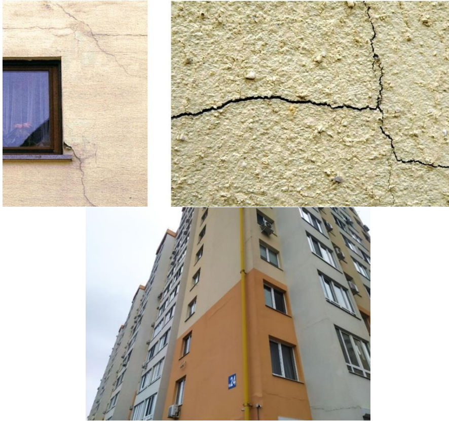
Fig. 2. Damaged insulated façade with cracks

To prevent and solve these problems, it is important to carry out regular technical inspection of the façade, take maintenance and repair measures, as well as choose high-quality materials for construction and cladding. Regular examinations allow you to identify problems in the early stages and avoid their further exacerbation. Maintenance, such as cleaning, painting, or repairing local damage, helps keep the façade in good condition and extend its lifespan. Additionally, using high-quality and age-resistant materials can reduce the risk of rapid wear and tear and help ensure the long-term life of the building.