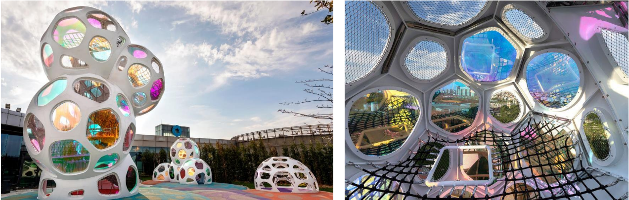
Fig. 2. Playground in Istanbul, landscape studio Carve

On the terrace of the Marmara Forum shopping center in the Istanbul district, an ensemble of assembled white spheres invites children to climb, roll down a hill and relax in a forest of hammocks (Fig. 2). The project, known as Cloud Playground due to the bulbous shape of the structures that look like clouds hanging over the building, was designed by the Amsterdam studio Carve. The limited area and location of the space – at a height of 24 meters above the street level – became the starting point of the project for the architects. Instead of a horizontal extension of the playground, the Carve studio looked for vertical forms with significant volumes that children can explore from within [7].