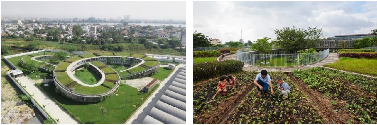
Fig. 3. Kindergarten in Bien Hoa

Typical solutions are not suitable for children even within the same age and social group. Children are more willing to interact with a space that is more amenable to change. One of the successful examples of this approach is the playground designed by the British Bureau Assemble in the Architectural Gallery of the Royal Institute of British Architects (RIBA) (Fig. 4). The play space is created using colorful modules made of recycled polyurethane foam. The lightweight material makes it easy to move these elements and its surface is easy to clean.